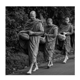
March Alms-round, Wat Pah Nanachat, NE Thailand