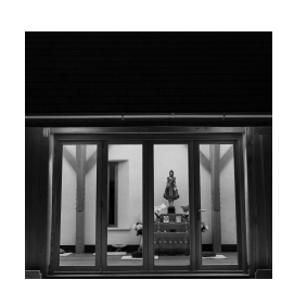
December Hartridge Monastery, Devon, UK