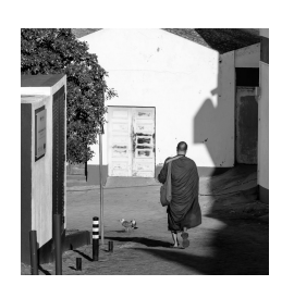
September Alms-round, Sumedharama Monastery, Portugal