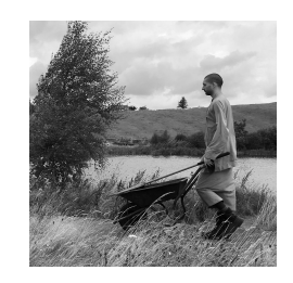
October Aruna Ratanagiri Monastery, Northumberland, UK