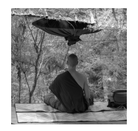
May Buddha Bodhivana Monastery, Victoria, Australia