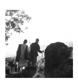
November Tudong, Santacittarama Monastery, Italy