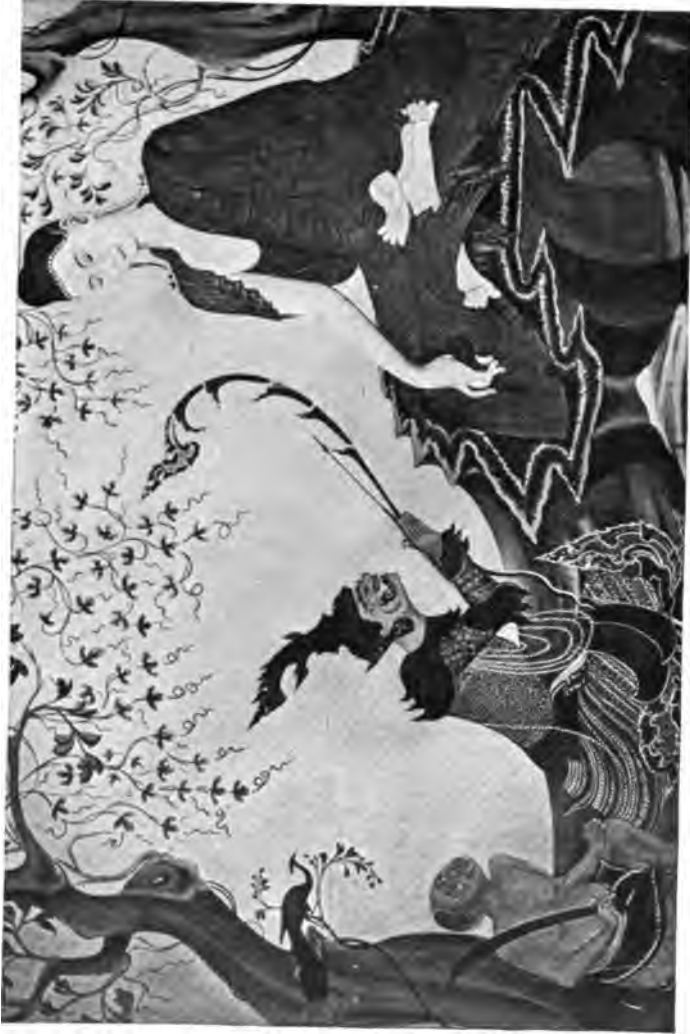
BURMESE FRESCO REPRESENTING THE BUDDHA WORSHIPED BY A FOREST SATYR AND HIS ATTENDANT.