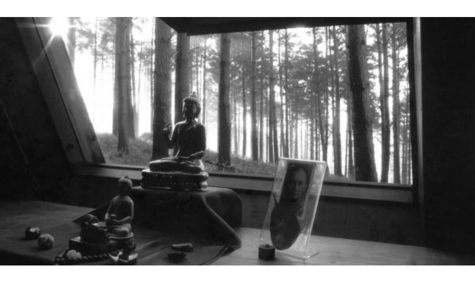
Having transformed evil one is called a great being. Living peacefully one is called a contemplative. Having given up impurity one is called a renunciate. (Dhp. v. 388)