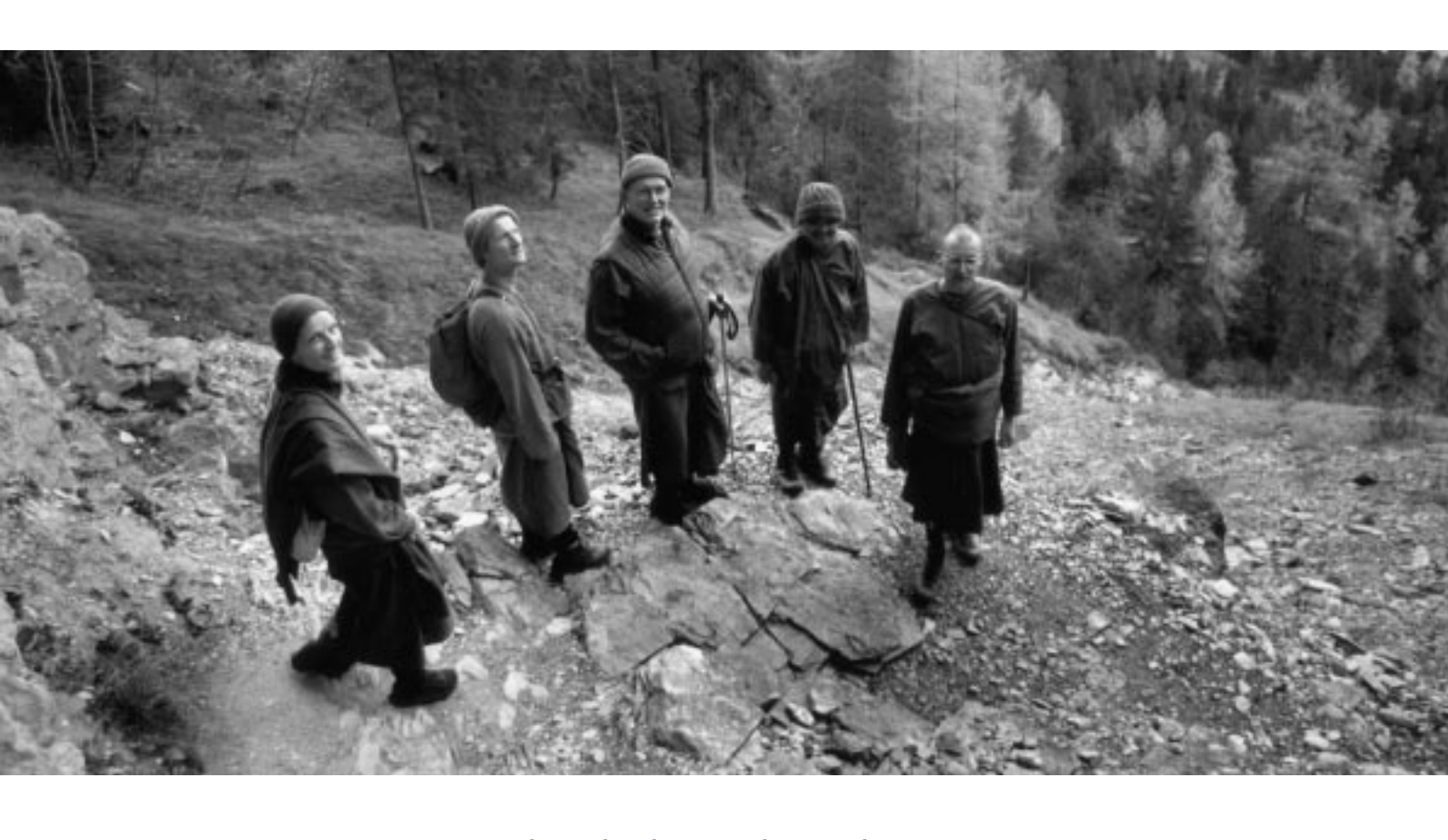
The Awakened Ones can but point the way; we must make the effort ourselves. (Dhp. v. 276)