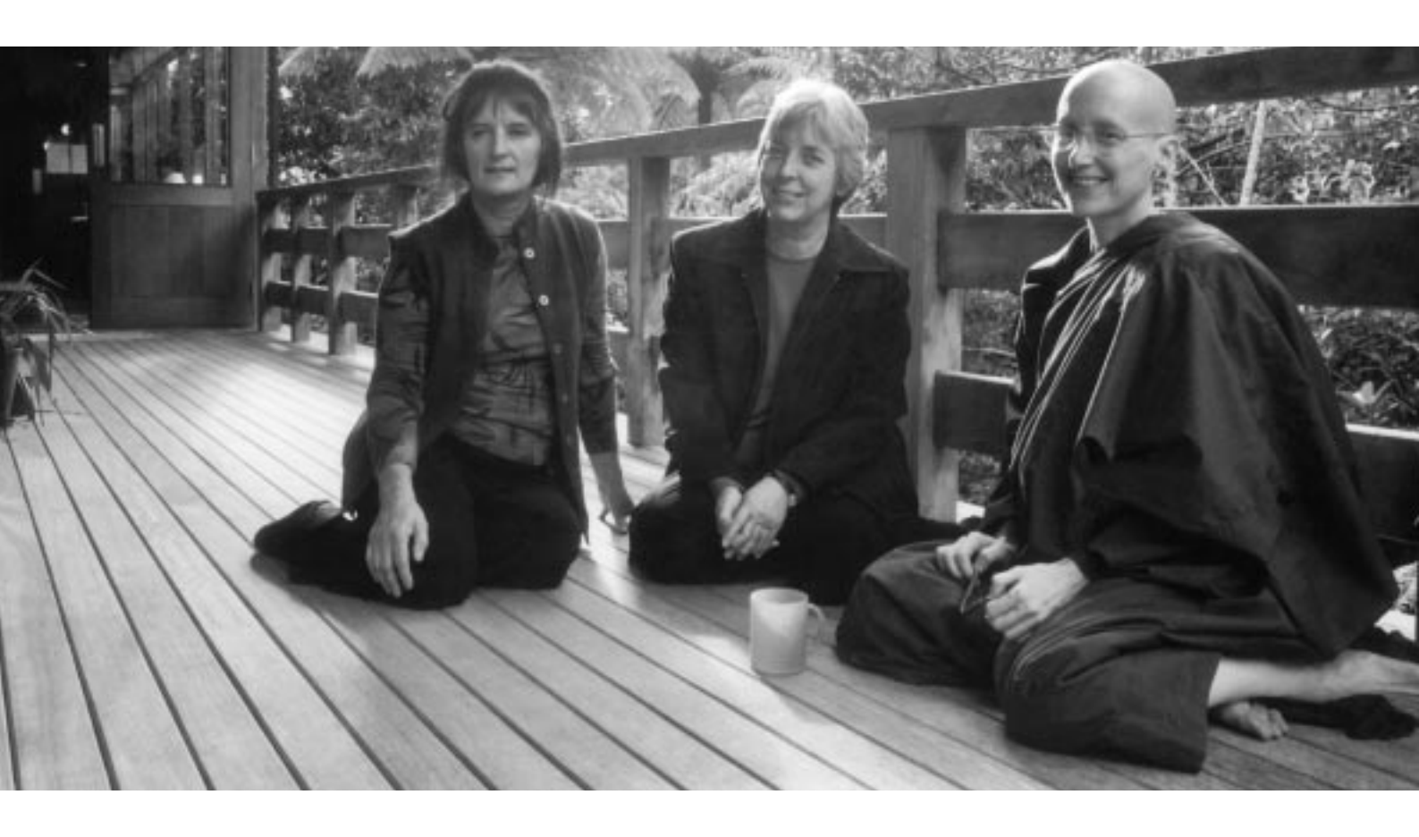
You become a monk or a nun by seeng through this world with understanding, by rising above good and bad and living a life of purity and contemplation. (Dhp. v. 267)