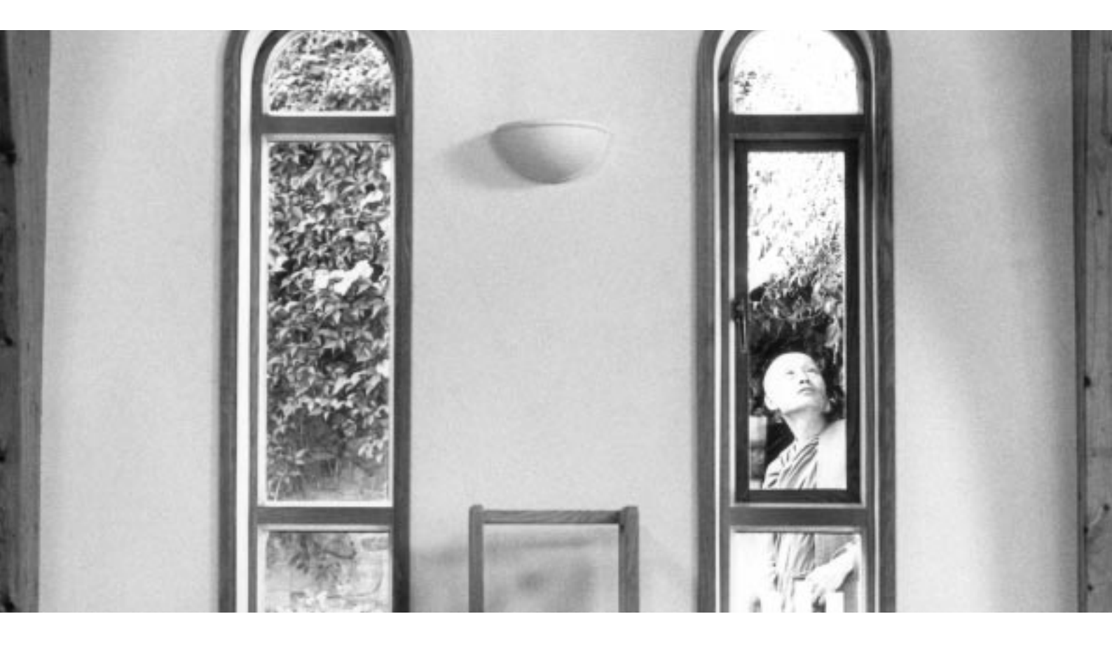
You should follow the ways of those who are steadfast, discerning, pure and aware, just as the moon follows the path of the stars. (Dhp. v.\ 208 )