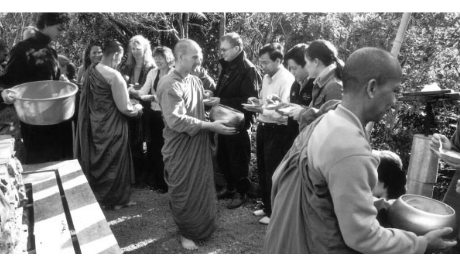
One who transforms old and heedless ways into fresh and wholesome acts brings light into the world like the moon freed from clouds. (Dhp. v. 173)