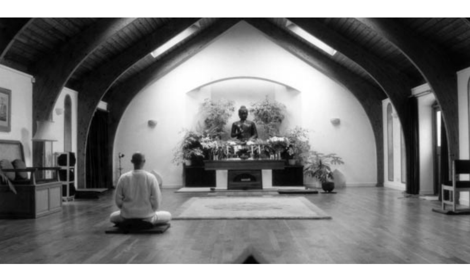
By endeavour, vigilance, restraint and self-control, let the wise make islands of themselves which no flood can overwhelm. (Dhp. v. 25)