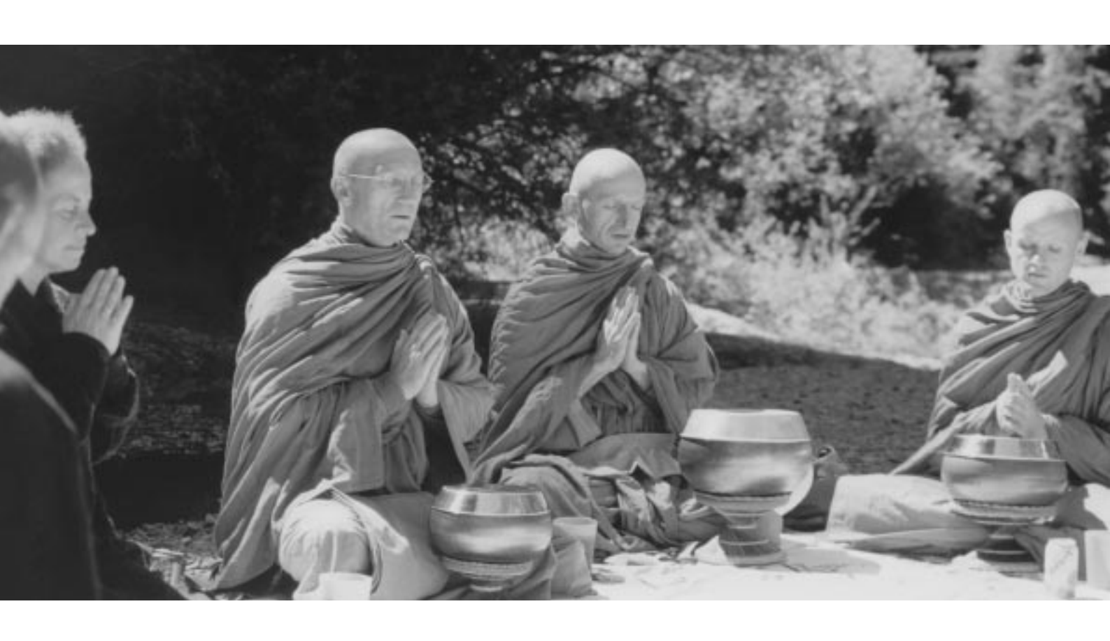
Beware of the attachment that springs from fondness, for separation from those one holds dear is painful, while if you take sides neither for nor against, there will be no bondage. (Dhp. v. 211)