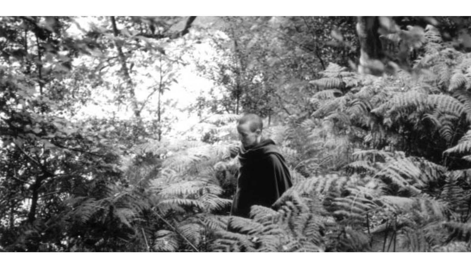
The beauty of pure conduct conditions whole-hearted well-being Giving rise to complete freedom from remorse. (Dhp. v. 276)