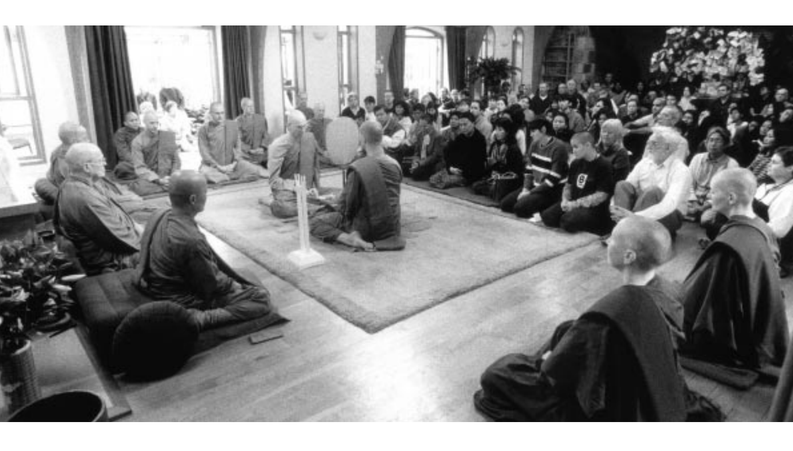
Blessed is the arising of a Buddha; blessed is the revealing of the Dhamma; blessed is the concord of the Sangha; delightful is harmonious communion. (Dhp. \nu . 194)