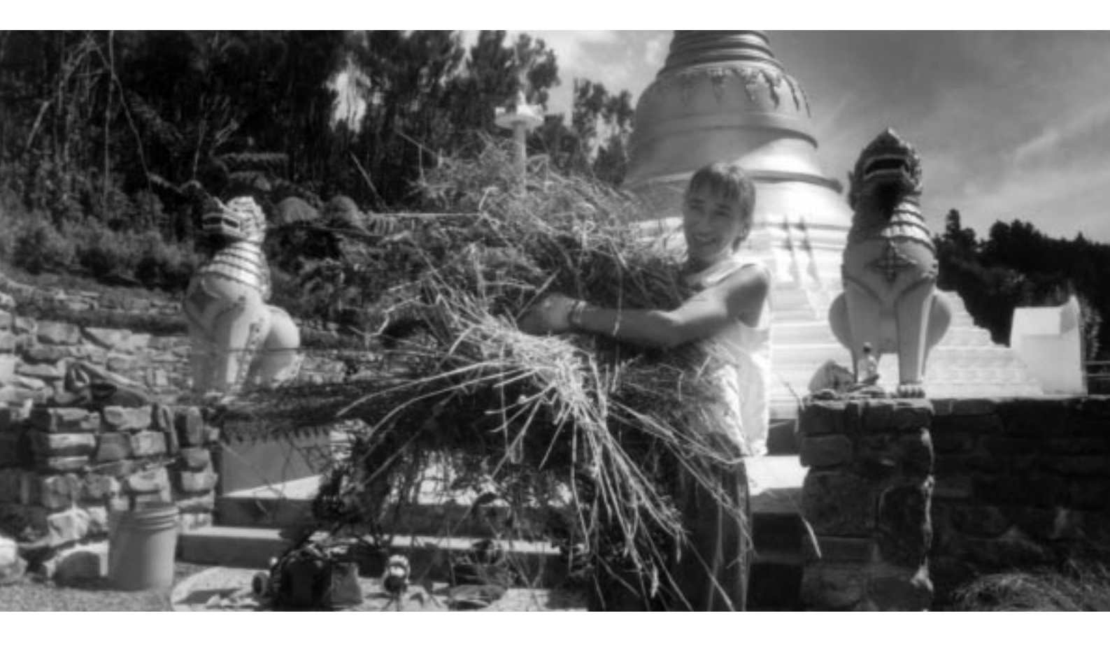
Having cleared all the hindrances to the Path - greed, rage, dullness and laziness, worry, anxiety and doubt - the noble being freely moves on. (Dhp. v. 295)