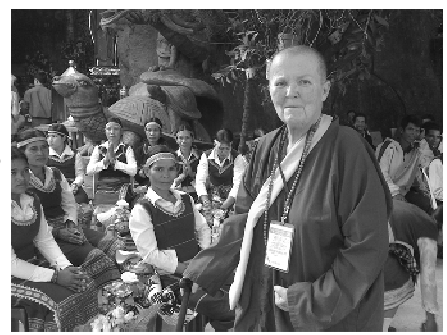
The 11<sup>th</sup> Sakyadhita Conference was well attended by Buddhist

ing the workshop elected a Webmaster from among them and she will continue to build the site through the coming year. Check out its progress at: <u>http://buddhadaughters.webs.com.</u>