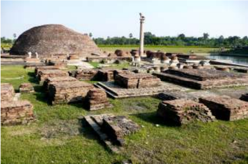
Plate 71: Another view of the Asoka Stupa on the north side shows a large number of votive stupas, pointing to the great importance of the place