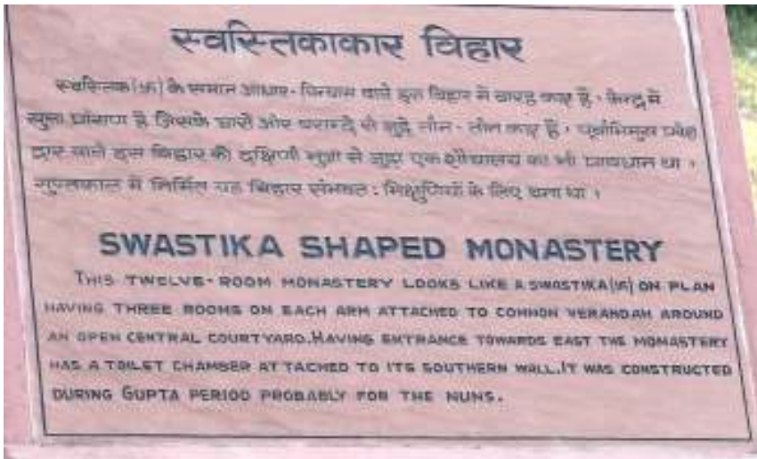
Plate 75: Nearby is another cement signboard identifying the site of a nunnery.