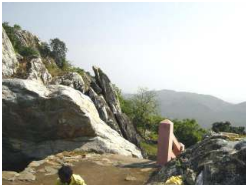
Plate 65: Near the cave, a staircase built for the convenience of pilgrims, leads to the summit, which has a wide cemented platform to accommodate pilgrims.