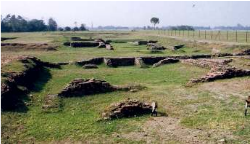
Plate 67: This 2001 photo shows the extensive, neglected ruins of the ancient city of Vaishali, located at the present day village of Basarh in Vaishali.

Vaishali derives its name from Raja Vishal of the Mahabharata era. The village of Basarh has been identified as the site of the ancient city of Vaishali. The site of the Raj Vishal ka Garh or Fort of Raja Vishal is believed to represent the citadel of Vaishali where the 7707 rajas or representatives of the Vajjian confederacy used to meet and discuss the matters of the day. The ruins consist of a large brick-covered mound 2.5 m above the surrounding level and 1500 m in circumference with a 42.7 m moat surrounding it. A kilometer northwest, near to the Relic Stupa of the Licchavis is a large pond believed to be the Coronation tank where the Licchavis used to anoint their elected representatives or rajas with its water.