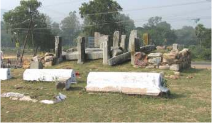
Plate 55: The ruins of the abandoned Ajatasattu Stupa at the entrance of Rajgir has been turned into a Muslim cemetery with tombs painted white as shown.