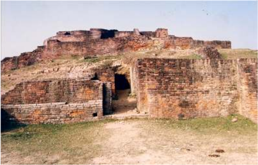
Plate 45: The Angulimala Stupa at Mahet showing the opening of a tunnel cut through it to prevent flooding and damage during the rainy season. It is believed that the stupa marks the site where Ven. Angulimala was cremated.