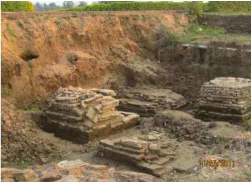
Plate 72: . In fact, recent excavations revealed more votive stupas on the other side of the Asoka Stupa as shown in this photo taken in 2011.