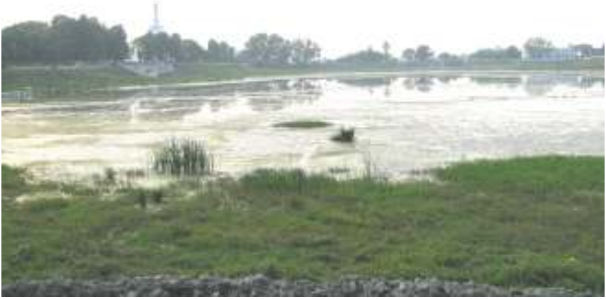
Plate 68: Abhishek Puskarni or Coronation tank at Basarh where the Licchavis used to anoint their rajas or elected representatives with its water. The white stupa in the background is the Shanti stupa built by Fuji Guruji of Japan.