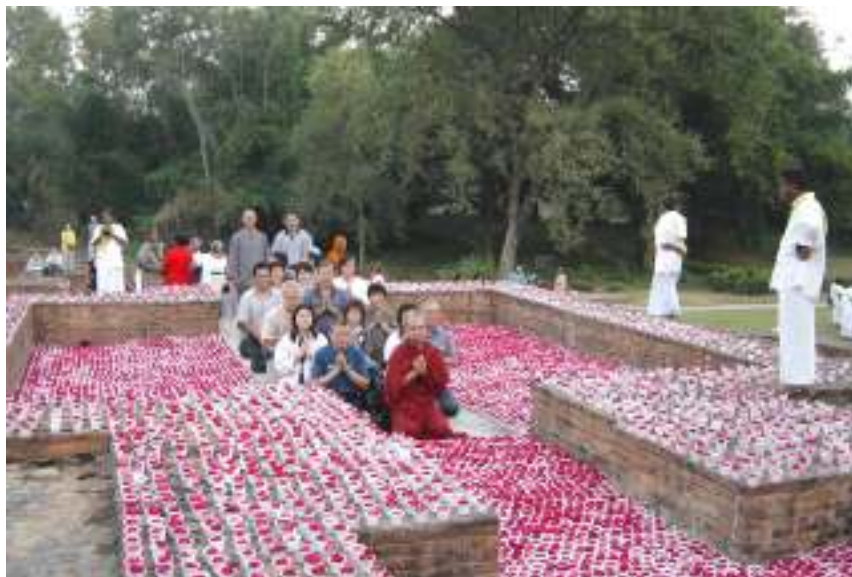
Plate 41: The Gandha kuti is the most revered shrine in Jetavana. This photo taken on the eve of Kathina 2002 shows some Sri Lankan devotees decorating the shrine with plastic cups filled with rose petals.