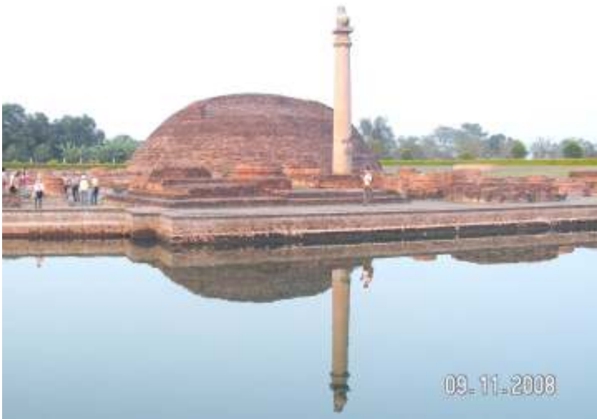
Plate 70: View of the main monuments at Kolhua from the south showing the famous Asokan Pillar crowned by the Lion Capital. Beside it is the Asoka Stupa erected by King Asoka when he visited Vaishali during his Pilgrimage in the 3 rd century BC. Note that the Lion Capital is pointing north, the direction that King Asoka took on his way to Lumbini as part of his Pilgrimage. In the foreground is a large tank that Xuanzang identified as the monkey tank.

Sometimes the Buddha would walk from the Kutagarasala to quiet places nearby, e.g., the Saranda shrine and Capala shrine. It was at the Capala shrine that the Buddha renounced the will to live on, three month before the Mahaparinibbana.