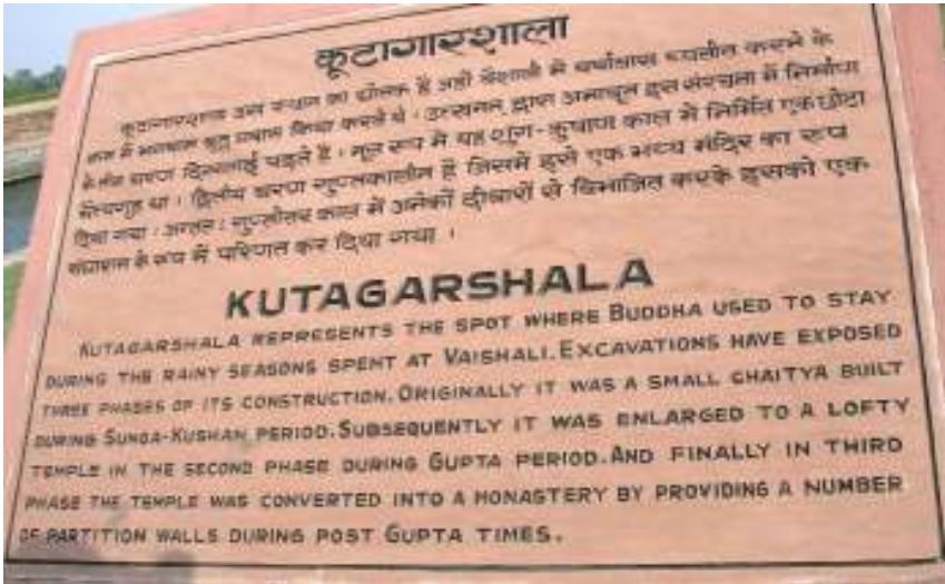
Plate 73: On the western side of the tank is a cement signboard identifying the site of the Kutagarasala, where the Buddha used to stay when he was in Vaishali