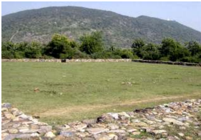
Plate 61: Ruins of Bimbisara jail where King Bimbisara was imprisoned by his son Ajatasattu and starved to death. The jail measures 60 meters square with 2-meter thick walls. On the hill beside a white stupa is Gijjhakuta (Vulture Peak).