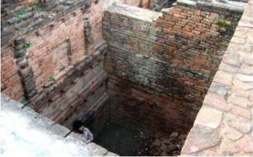
Plate 44: At the top of the Sudatta Stupa is a grand plinth, from which one can see the basements of two circular stupas, furnishing the only evidence that this is a Buddhist structure.