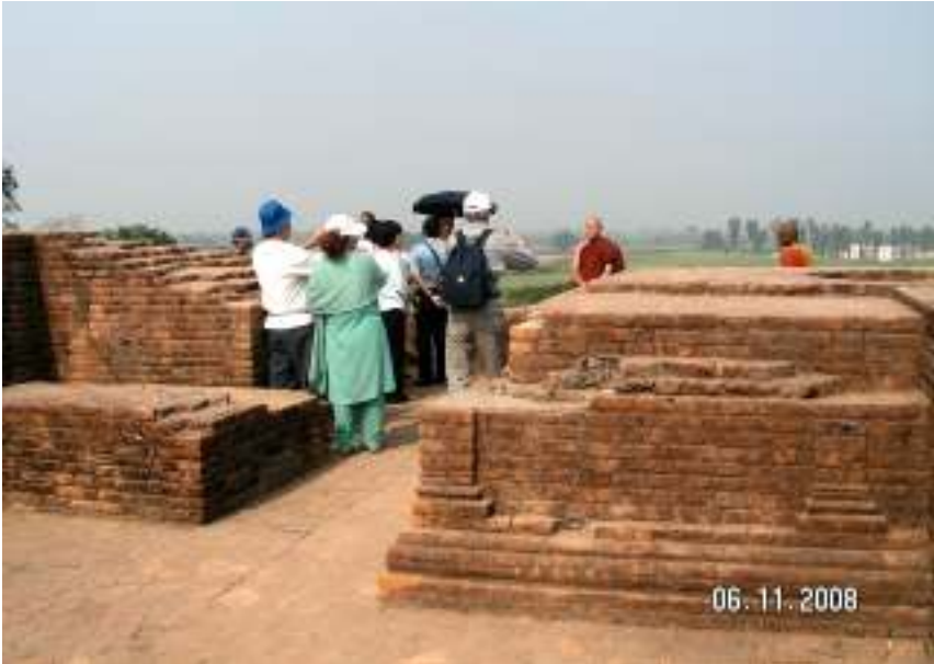
Plate 47: Picture shows the brick structure of the stupa at the top of Miracle Hill in Sravasti.