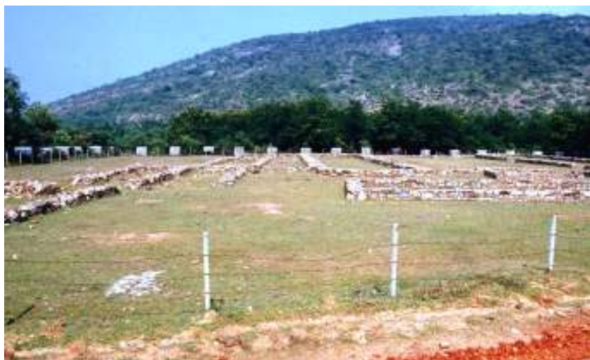
Plate 62: Ruins of monasteries at the Jivaka Mango grove in Rajagaha.