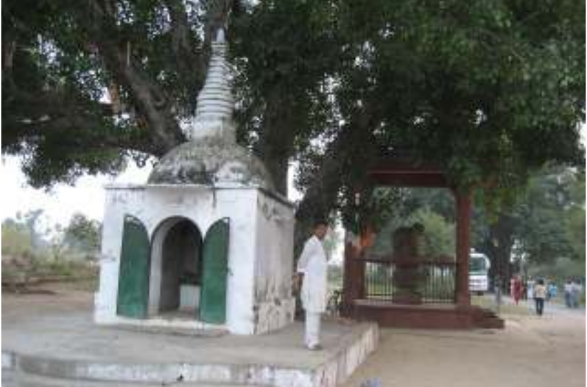
Plate 49: Rustic scene in Sankasia showing the shrine commemorating the Buddha’s Descent from Heaven. In the background is a pavilion displaying the famous Elephant Capital from the 3 rd century BC