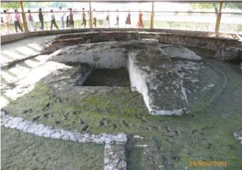
Plate 69: The original relic stupa of the Licchavis at Basarh was made of mud. At the center of this stupa is an open trench, believed to have been made by King Asoka when he came to collect part of the relics for re-distribution.