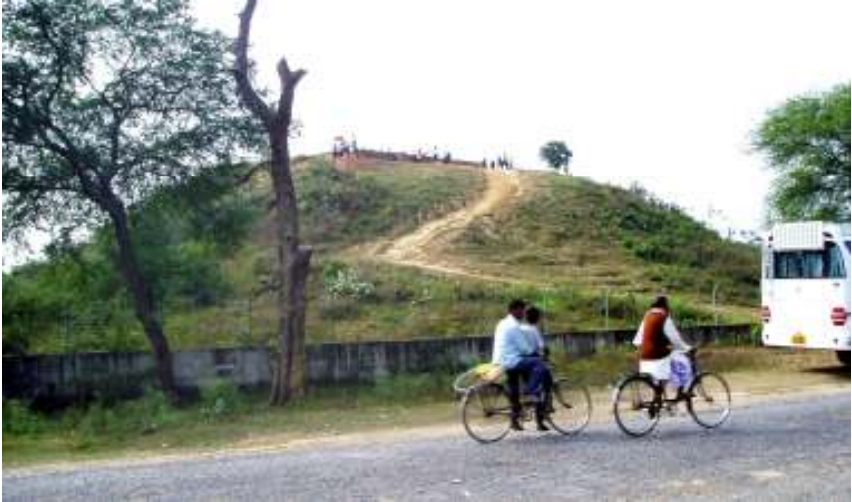
Plate 46: This hillock opposite the Nikko Lotus Hotel in Sravasti is believed to be the ‘Miracle Hill’ where the Buddha displayed the Twin Miracle in order to silence the heretics. At the top is a brick stupa believed to be built by Asoka, to commemorate the great miracle. It is named ‘Orajhar’ by the locals.