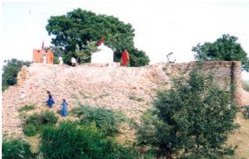
Plate 53: This was what was left of the brick structure in 2003 after torrential rains during an unusually heavy monsoon completely destroyed the structure.