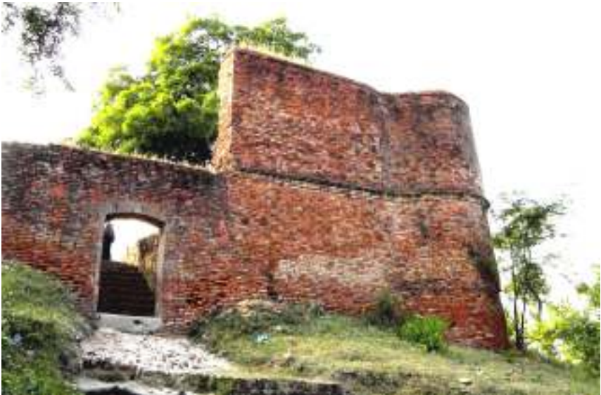
Plate 52: A 2002 photo showing the 6m high brick structure that was the remains of a Buddhist temple. Cunningham identified it as the place where the Buddha set foot at Sankasia upon his Descent from Heaven. In 2003, torrential rains during an unusually heavy monsoon completely destroyed the structure.