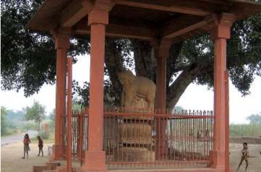
Plate 51: This famous Elephant Capital dated 3 rd century BC was discovered by Cunningham during archaeological excavations in Sankasia.