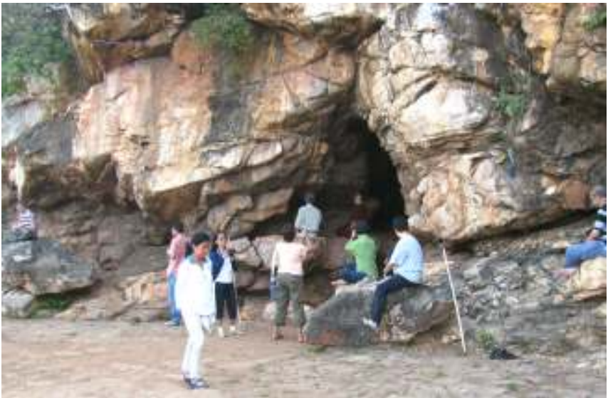
Plate 60: A long narrow terrace fronts a line of 6 caves (originally might be 7). Four of the caves are all in good conditioned but are sealed for safety reasons