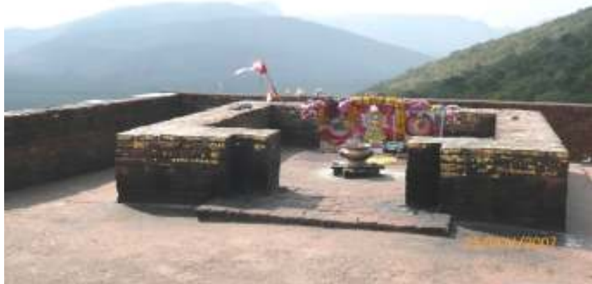
Plate 66: This shrine at Vulture Peak is the most popular spot in Rajgir where pilgrims perform puja. This is but natural as the place was the favorite resort of the Buddha and the scene of many of his important discourses.