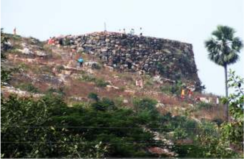
Plate 57: Pippali stone house as seen from the road at the foot of Vebhara hill