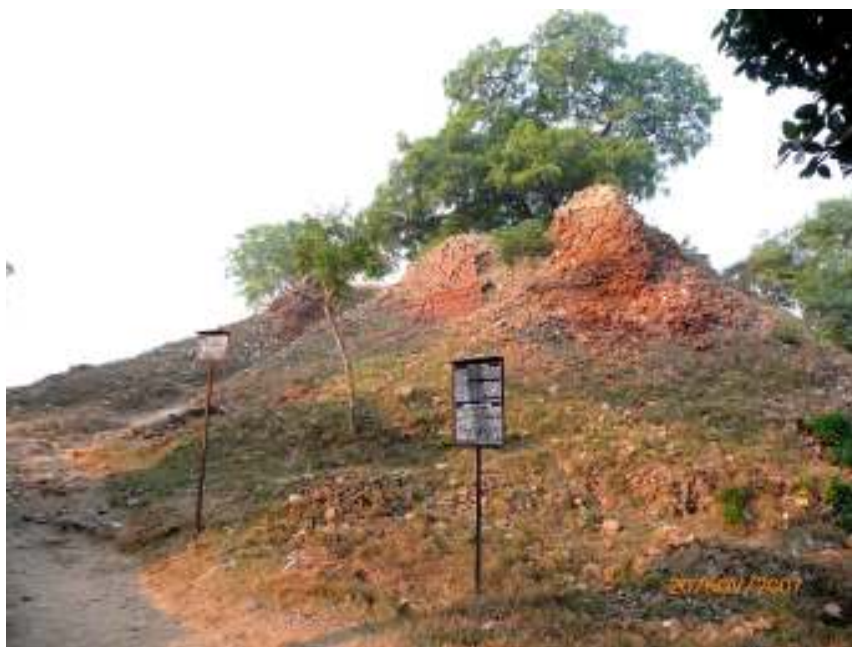
Plate 54: By 2007 the brick structure had disappeared, leaving behind a mound of earth to remind us of the impermanent nature of all conditioned things.