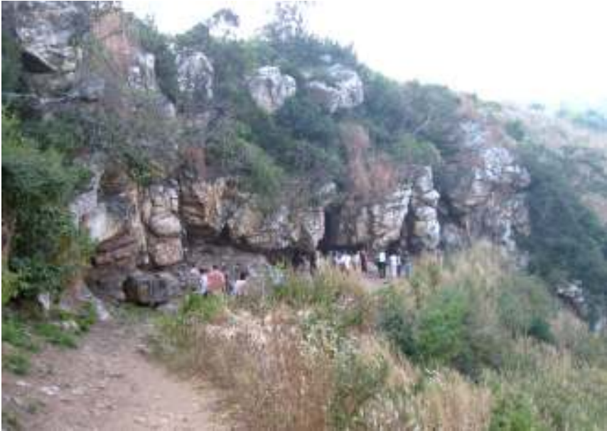
Plate 59: From Phippali stone house, one has to climb the rocky path till the largest Jains temple is reached. From there a narrow path descend to Sattapanni