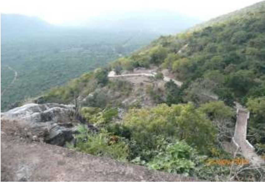
Plate 63: View of the Bimbisara road seen from the summit of Vulture Peak.