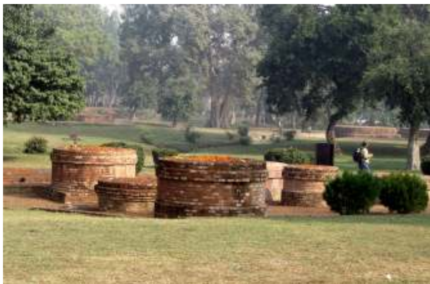
Plate 42: Photo of the Group of Eight Stupas in the stupa area at Jetavana