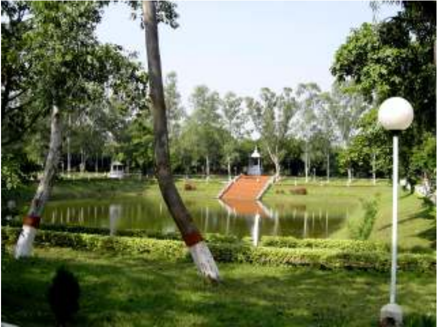
Plate 56: Photo of the Squirrel's Feeding Ground of Veluvana. In the middle is a pond identified as the Karanda tank where the Buddha used to bathe in.