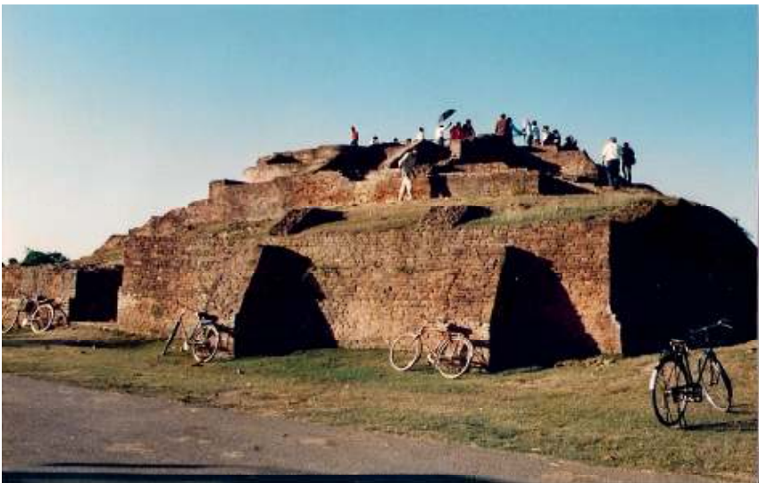
Plate 43: Picture shows the imposing Sudatta Stupa at Mahet, situated about ½ kilometer from Jetavana. This stupa was built over the foundations of the house of the Buddha's chief benefactor Sudatta, popularly known as Anathapindika, or "Feeder of the Destitute."

North of Jetavana, in the ruins of Mahet (old Sravasti city) stands the Sudatta stupa , the most imposing monument in the area. According to Fa Hsien, this stupa was built on the foundations of the house of Sudatta, popularly known as Anathapindika. The ruins show structural remains from the 1 st to the 12 th centuries AD. From the road, one has to climb up several flights of steps to reach the plinth, where one can see the sunken basements of two circular stupas.