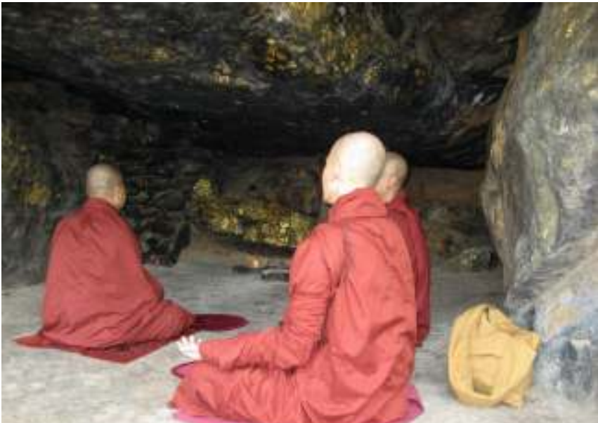
Plate 64: Just before the summit of Vulture Peak, one can see a large cave. It is believed that the Buddha used to meditate in this cave.