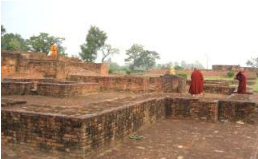
Plate 40: The ruins shown above marks the original site of the Gandha kuti built by Anathapindika for the official residence of the Buddha.

The ruins here mark the site of the Gandha kuti (Perfumed Chamber) built by Anathapindika for the Buddha's residence. According to the Buddhavamsa Commentary, the space covered by the four bedposts of the Buddha's Gandha kuti in Jetavana is one of the four avijahitatthānāni or places that do not vary for all Buddhas. The original Gandha kuti was wooden but by the time the Chinese pilgrims saw it, the structure was a two-storied brick building in a ruinous condition. Now only the low walls and stone platform are extant. This is a favourite site for pilgrims to pay homage to the Triple Gem ( puja ) and meditate.