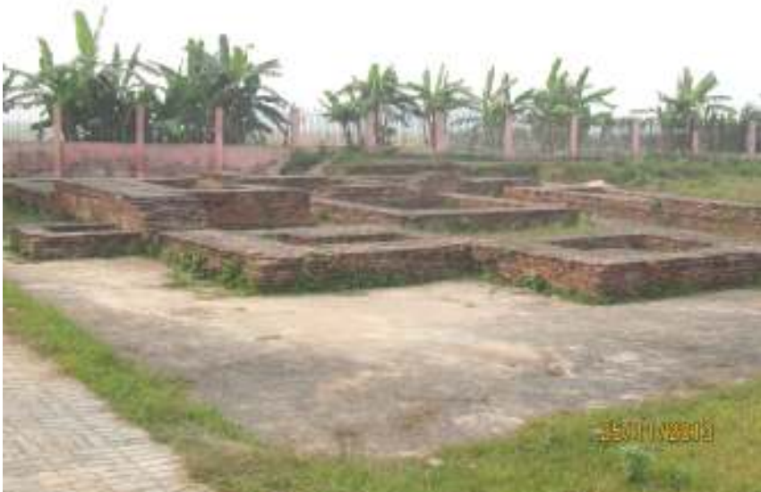
Plate 76: Ruins of a 12-room nunnery constructed during the Gupta period for the residence of nuns. The Gupta period was from 320 to 550 AD and is known as the Golden Age of India in science, mathematics, astronomy, religion and philosophy.