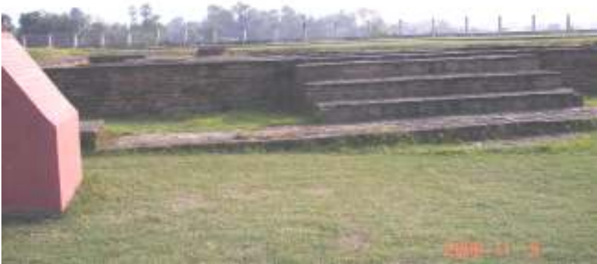
Plate 74: Ruins of a monastery from post-Gupta period built on the site of the original Kutagarasala. The post Gupta period is around the 7 th century AD, the time when Xuanzang visited this place. When Faxian came during the early 5 th century AD, he described the Kutagarasala as a two storied tower.