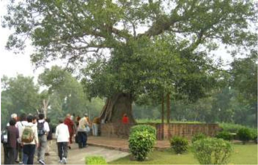
Plate 38: The Ananda Bodhi tree is a favourite shrine of pilgrims when they enter Jetavana. Most pilgrims circumambulate the tree as a mark of respect.