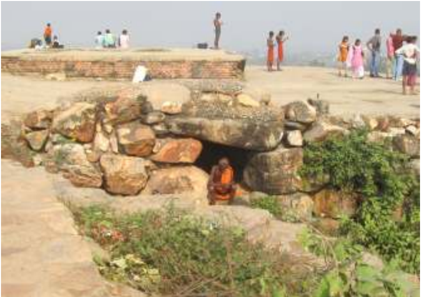
Plate 58: Close view of Pippali stone house, which used to be the residence of Ven. Maha Kassapa. Above it is a circular brick structure, probably the base of a stupa built to honor the great arahant known as the “Father of the Sangha”.