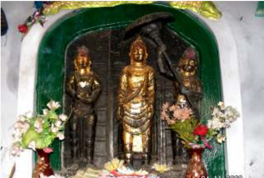
Plate 50: Inside the shrine are images depicting the Buddha’s Descent from Heaven, flanked by Sakkadevaraja and Maha Brahma holding a parasol.