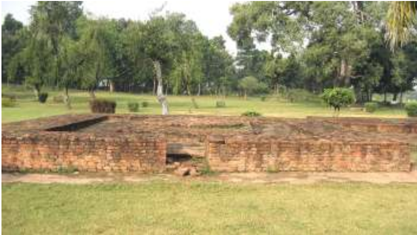
Plate 39: On entering the ancient ruins after the Ananda Bodhi tree, the first shrine on the left is believed to mark the very spot where the original Kosambi kuti, built by Anathapindika for the personal use of the Buddha, once stood. Just across it is a raised brick platform to mark the site of the cankama , where the Buddha practiced walking meditation.